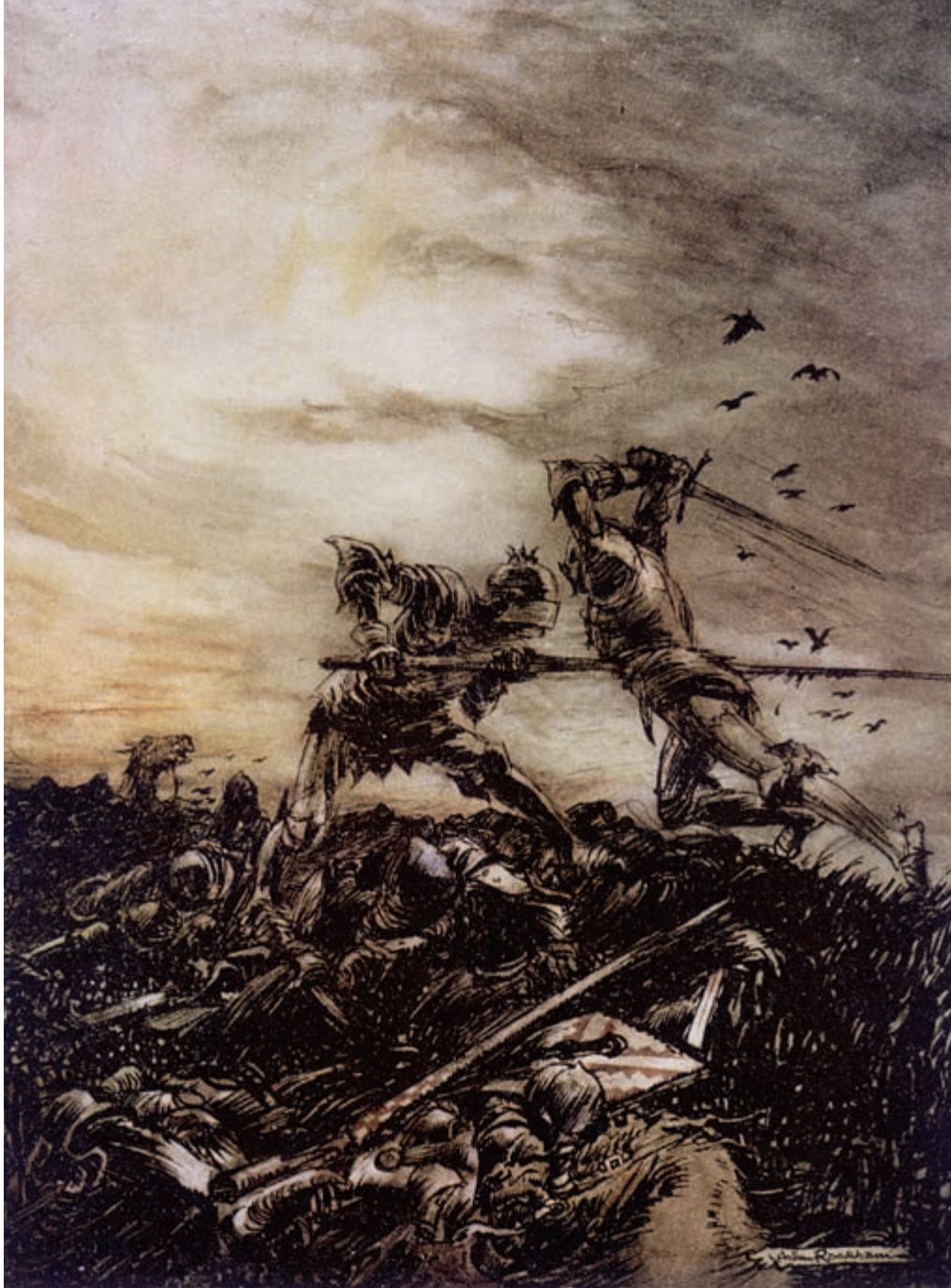
Arthur Versus Mordred , Arthur Rackham. Illustration from The Romance of King Arthur .

“My lord, it surely would be better to move you to the nearest town?”